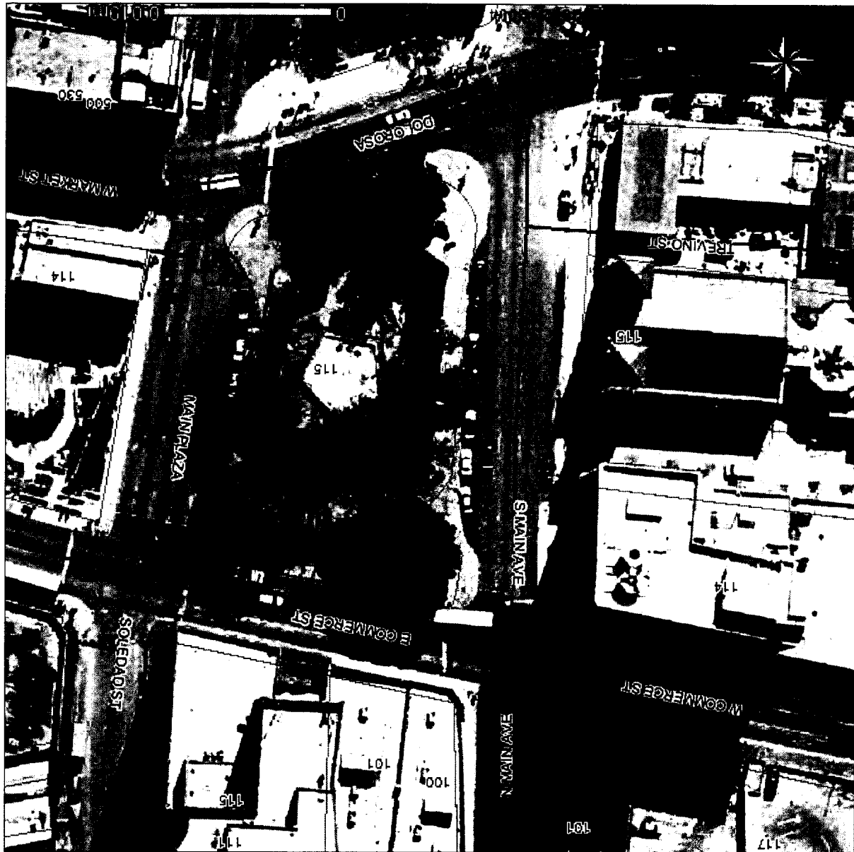
N. Main Avenue between W. Commerce and Dolorosa